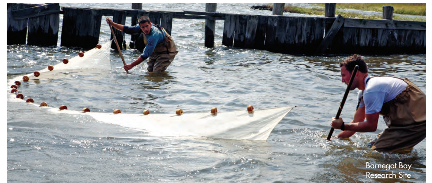
Barnegat Bay Research Site