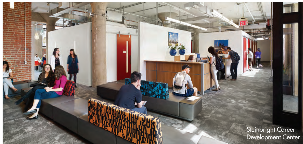
Steinbright Career Development Center