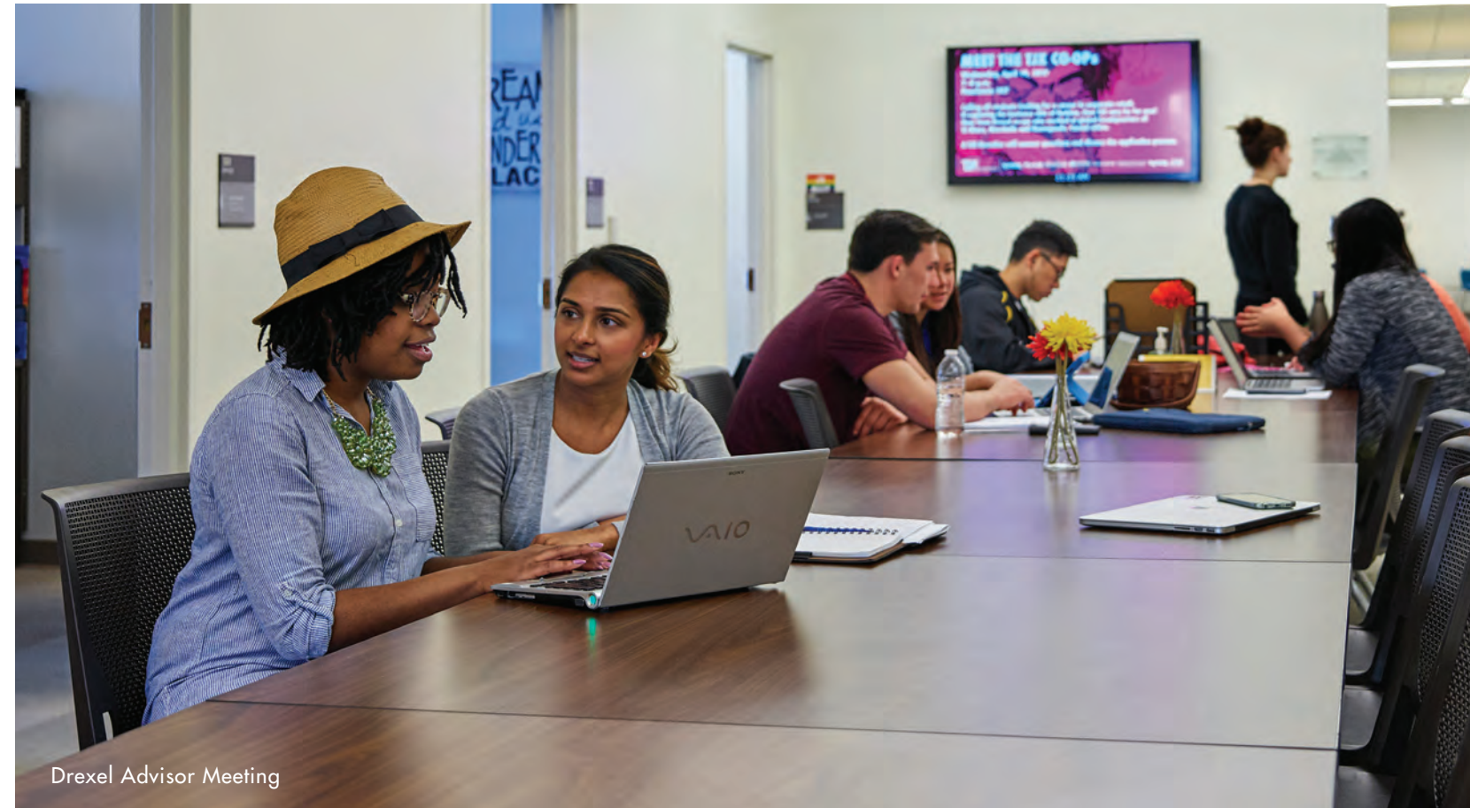
Drexel Advisor Meeting