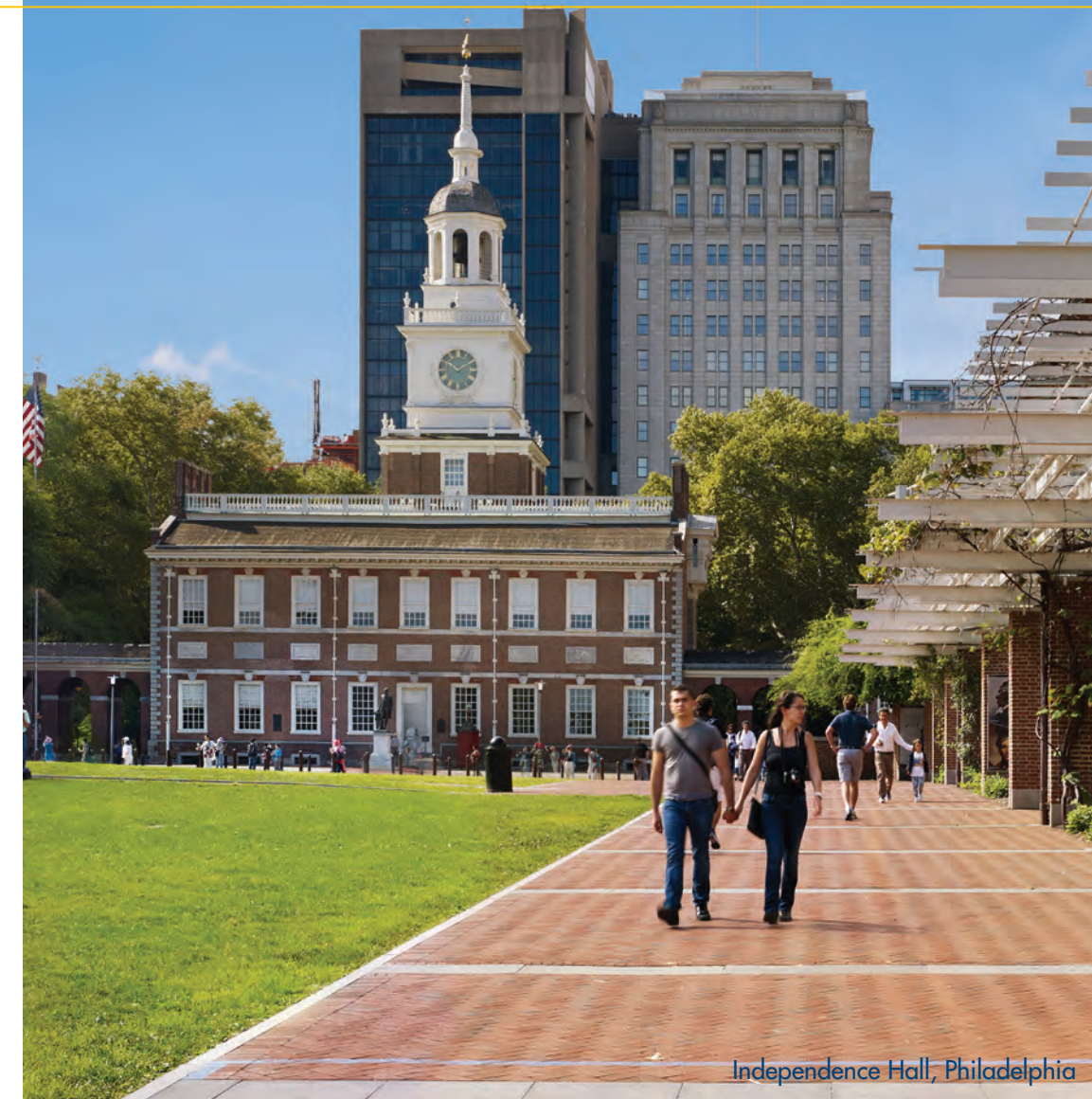
Independence Hall, Philadelphia

Global Opportunities: These options include study abroad, international co-op, and more. All Drexel students can take advantage of study abroad, which enables them to live and learn in another country while immersing themselves in the culture. Using our worldwide connections, you can choose from six continents and 65 countries! International co-op takes study abroad one step further; students not only live in another country but also gain work experience as they test-drive a potential career. Students currently on international co-op are working in over 44 countries.