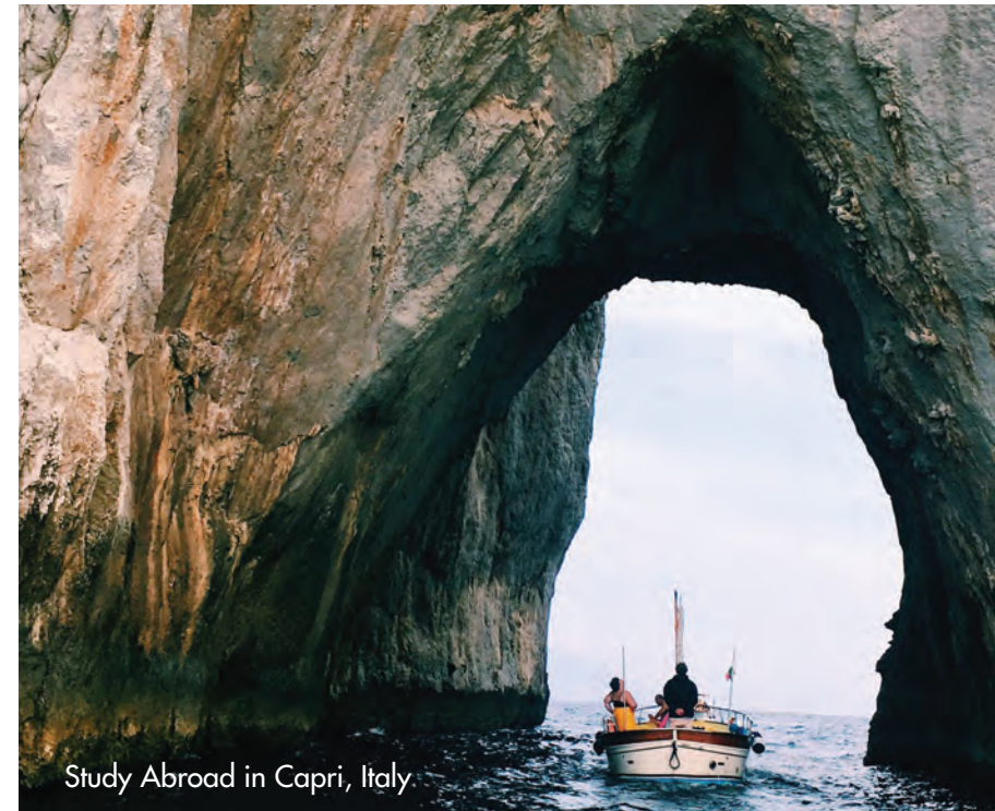
Study Abroad in Capri, Italy

Civic Engagement: We believe in the importance of giving back to local communities — there are always opportunities to make an impact and serve the community here. Students can get involved on campus through Drexel's Lindy Center for Civic Engagement and the Dornsife Center for Neighborhood Partnerships during community-based learning courses and volunteering for community service. But our impact doesn't stop there; our dedication reaches out globally to improve the world around us.