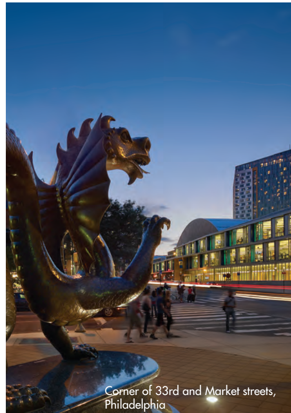
Corner of 33rd and Market streets, Philadelphia

Once you've chosen your major, Drexel's cooperative education program will prepare you for life after higher education in a way that no other university can. Learn more about our First-Year Exploratory Studies program at drexel.edu/academics .