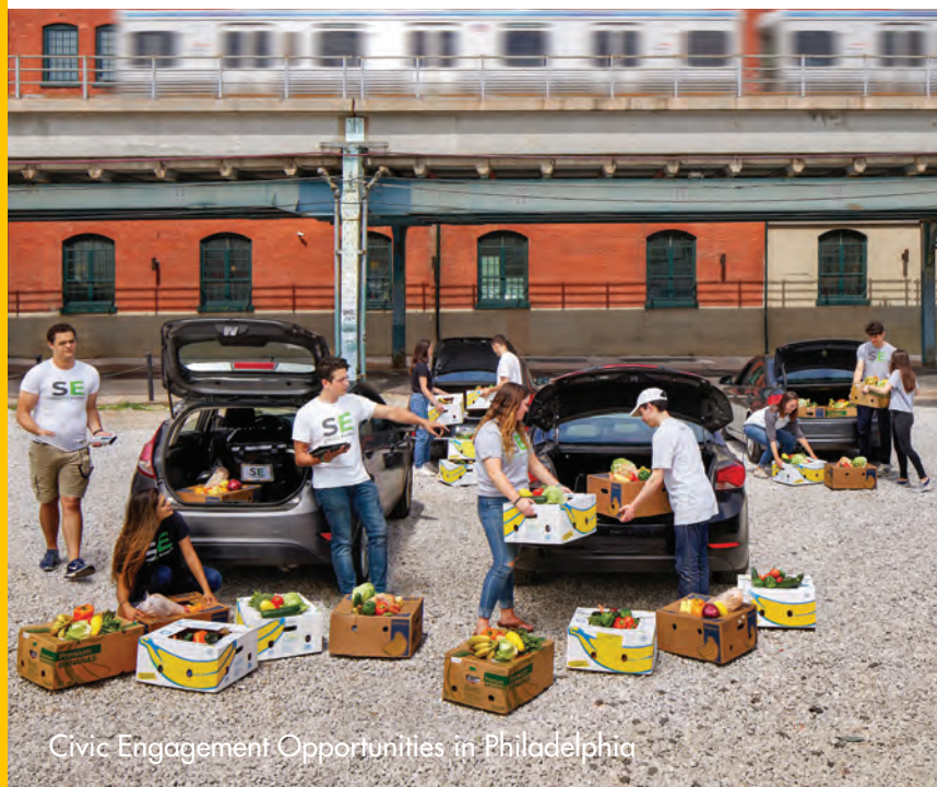
Civic Engagement Opportunities in Philadelphia

Public transportation is just steps away from campus — it's easy to enjoy an authentic cheesesteak and then visit the famous Philadelphia Museum of Art. You will find that all areas of the city are interconnected by simple means of travel, and getting to historic sites around the city or connecting to various locations across the country is an easy task. Living in Philadelphia provides access to everything from farmers' markets in Lancaster County to ski and snowboarding locations in the Pocono Mountains to the best beaches in the Mid-Atlantic.