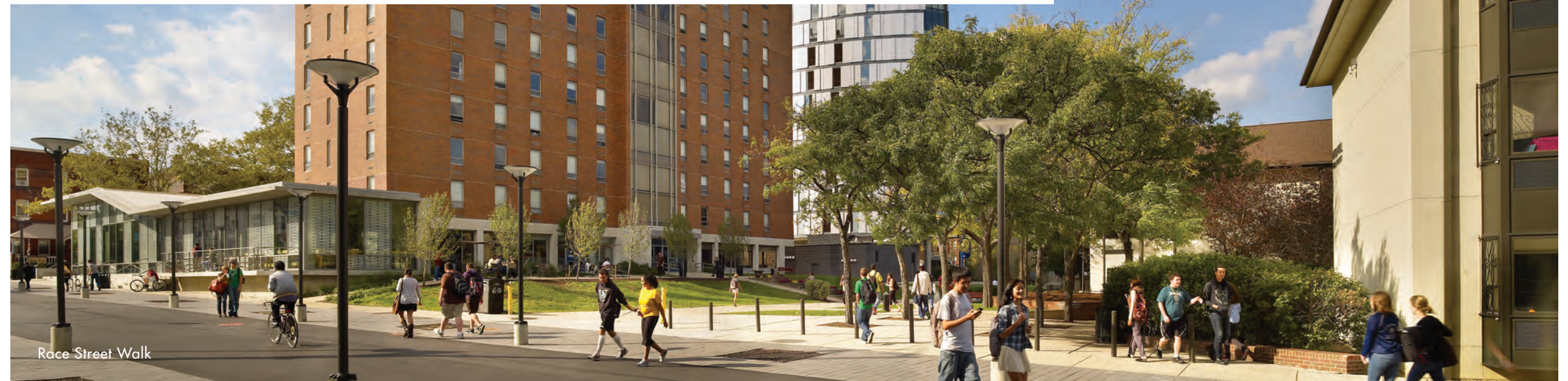
Race Street Walk