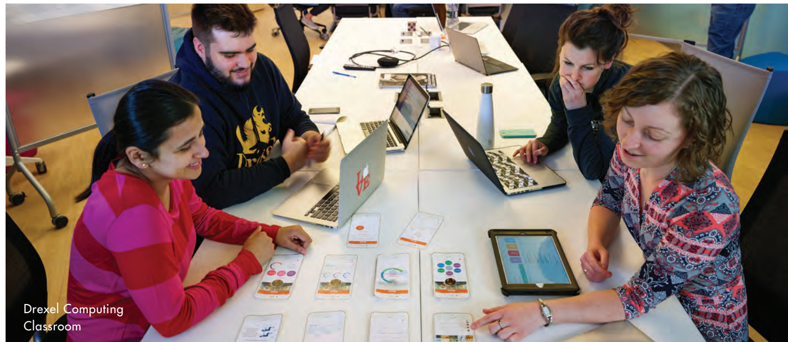
Drexel Computing Classroom

Drexel's Cooperative Education program truly elevates our custom-designed major. Your highly specialized undergraduate degree will be accompanied by an impressive résumé filled with professional work experience that sets you up for career success from the second you start your first class. Learn more about this exciting option at drexel.edu/academics .