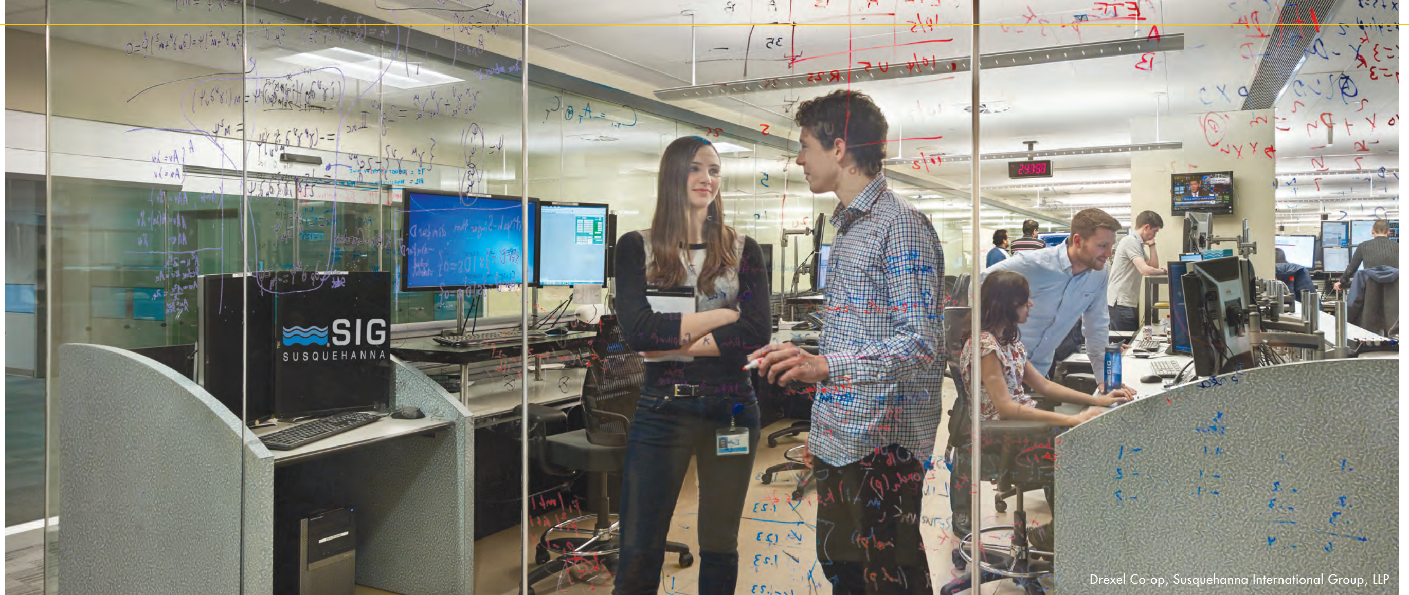
Drexel Co-op, Susquehanna International Group, LLP

The Steinbright Career Development Center, one of the largest collegiate co-op and career services teams in the world, sets you up for success at Drexel from day one. Whether you're looking for potential co-op employers, research opportunities, or post-graduate endeavors, Steinbright connects you to Drexel's constantly growing network of employers and industry leaders while also building your résumé and interview skills through workshops and information sessions. Our unique combination of world-class career services and dedicated counseling professionals will help guide you to discover your interests and develop your professional tools.