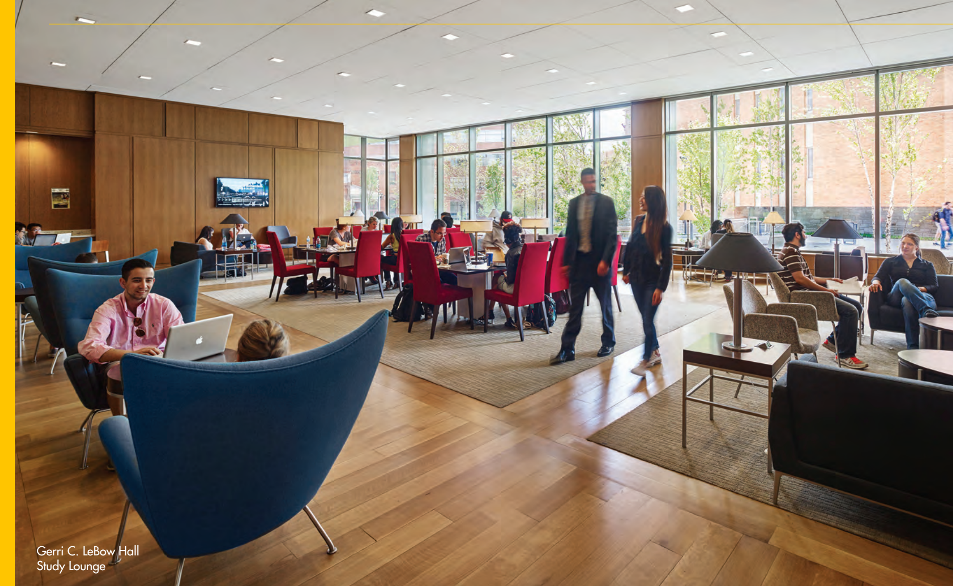
Gerri C. LeBow Hall Study Lounge

Even if you already know your preferred area of study, choosing a specific program can be a task within itself. Perhaps you know that you're interested in business, the arts, or engineering but are overwhelmed by the myriad of concentrations to choose from. Selecting your focus is an important step in the educational process, and that's why some students benefit from the choice of an undeclared option.