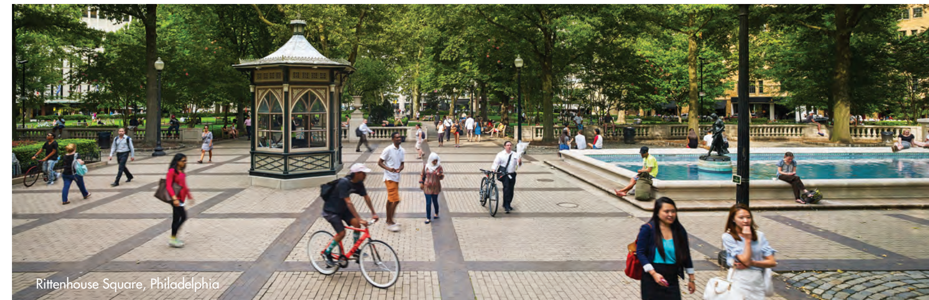
Rittenhouse Square, Philadelphia