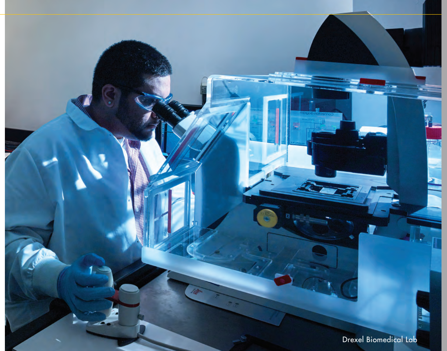
Drexel Biomedical Lab

College is a transformative experience — one where you discover the career path that is best for you but also find who you are and where your interests lie. At Drexel, there are many resources for students who haven't yet selected a major and need some time to figure out what they want to get out of their education.