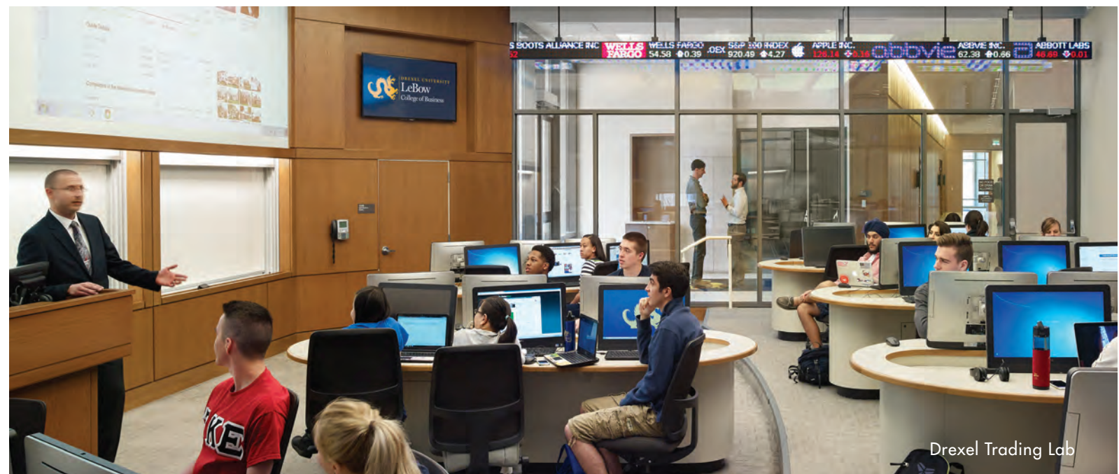
Drexel Trading Lab

Through our cooperative education program, regardless of what you choose, you'll leave Drexel with an extensive résumé and professional work experience that will prepare you for future success.