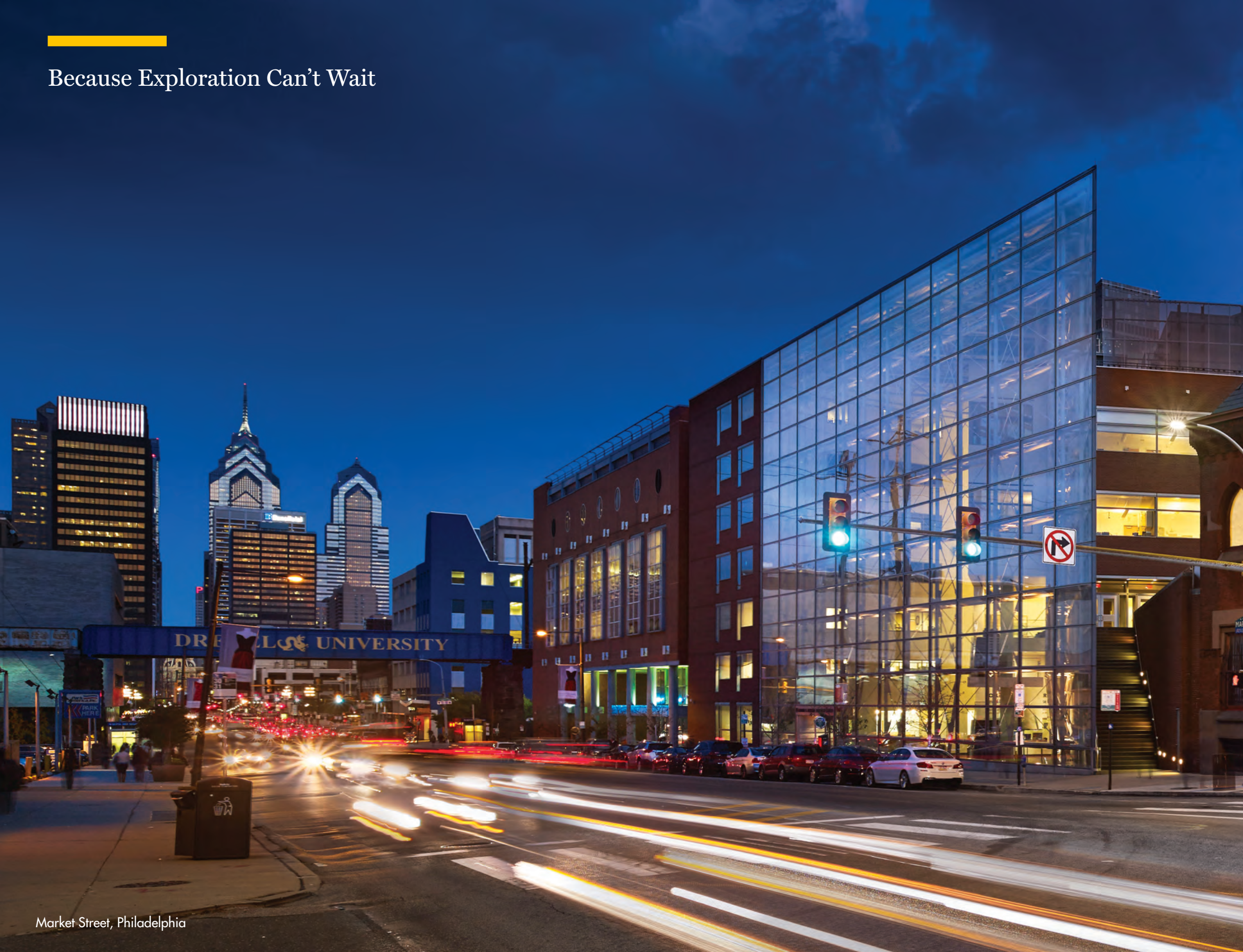
Market Street, Philadelphia